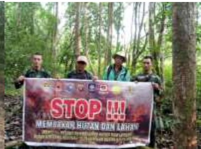
Fire Prevention Campaign