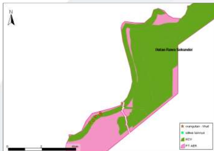
The estimated number of orangutans living inside the HCV area

However, those indicator is not really accurate due to a lot of factors that may affect how fast the nest withered such as weather, the height of the tree, and the tree or leaves types used by the orangutan to form the nest. Currently, the satgas is learning about this matter to find out more accurate indicator.