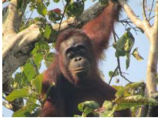
Female Orangutan found inside the HCV