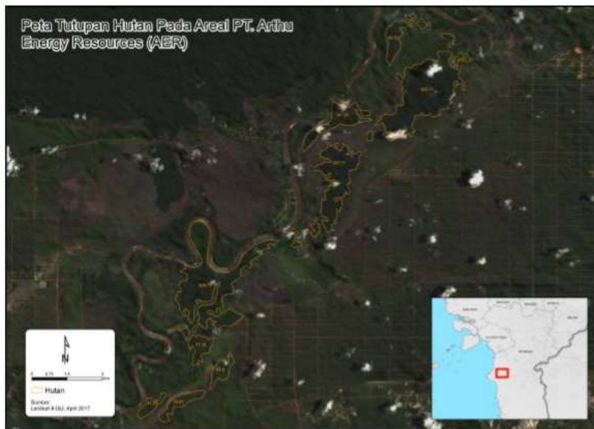
Nine major forest blocks inside PT AER Block II