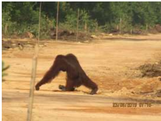
One Male Orangutan found outside the HCV crossing the new road

The two last pictures showed that there will be a big potential for Human-orangutan conflict to occur in this area because there are some orangutans were living outside the HCV and the worst part is by the road which one day will become a busy road that connect Kab. Ketapang and some kecamatan like Kec. Muara Pawan, Kec. Laman Satong, Kec. Nanga Tayap and Kec. Sandai.