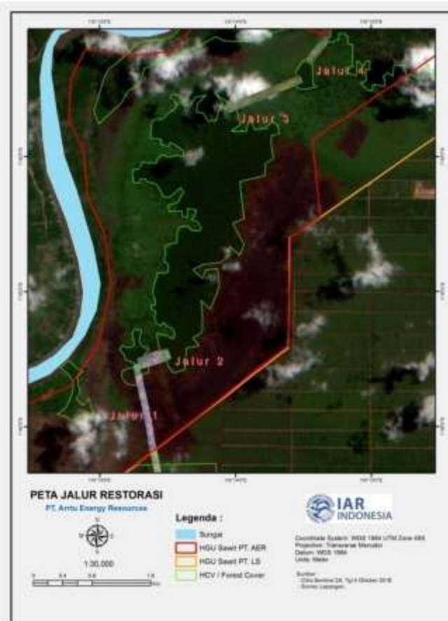
Restoration Plan Map