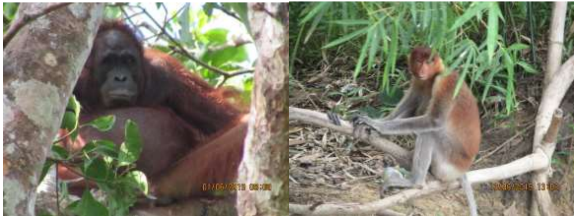
Orangutan ( Pongo pygmaeus )