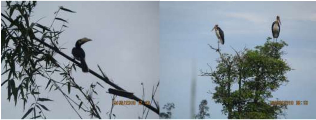
Oriental Pied Hornbill Anthracoceros albirostris