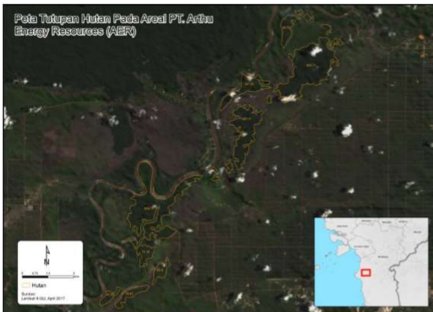
Nine major forest blocks inside PT AER Block II