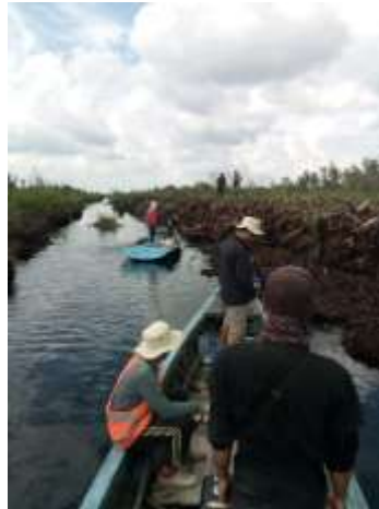
PT Limpah Sejahtera's Boundary