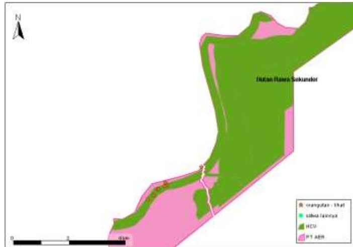
The estimated number of orangutan living inside the HCV area