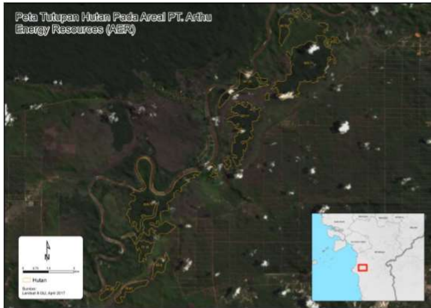
Nine major forest blocks inside PT AER Block II