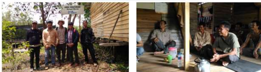
Restoration Camp of YIAR

From the visit, HOTP, Sustainability Assistant and Coordinator are working together to design the restoration plan which is located in the HCV area connected to HCV area of PT Limpah Sejahtera (FR). The initial plan will cover only 5 Ha (50 m x 1000 m) with purposes: