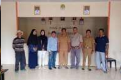
Meeting with Mayak Governor