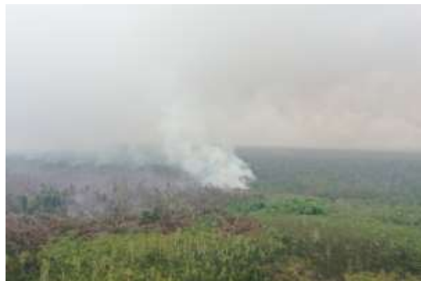
Picture taken from drone