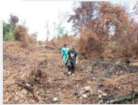
The condition on 30 th September 2019

This fire event was a lesson from everyone that even in the unpredictable area, the fire could start. Due to this event, the management decided to equip the Satgas team with complete fire equipment: