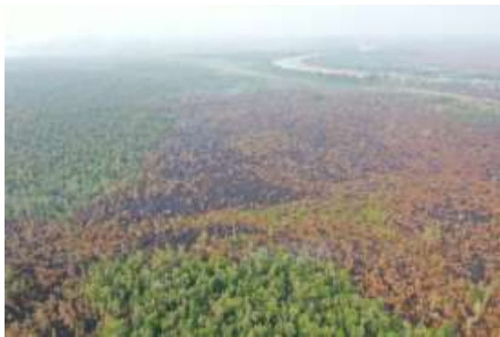
HCV Lost around 40 Ha to fire